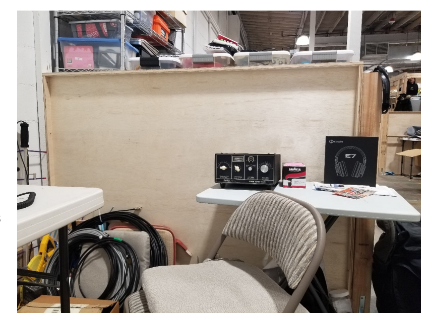
W1BOS at Artisans Asylum

Keep watch both here and on our message groups for more updates on the Artisans Asylum project!