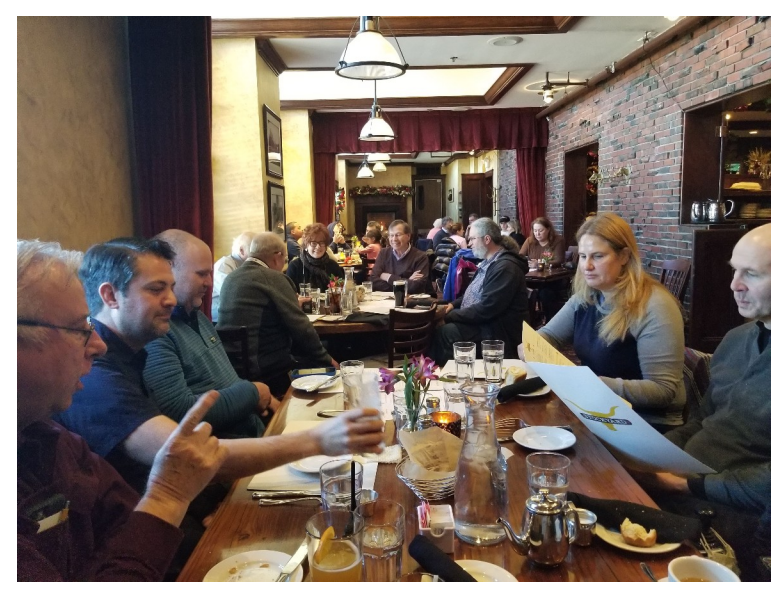
The Place! The People!