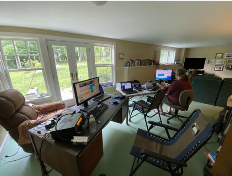
N1QD, KB1JGZ, and K1SU Set Up for Field Day

There weren't any KL7 stations on the ARRL FD map, and, there didn't appear to be any evidence of them anywhere during the hours that VOACAP thought I had the best chance of making a contact, so WAS will have to wait a while longer.