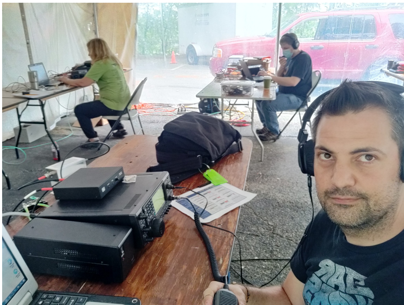
NW1S visits the Great Hill Gang in Weymouth

We have a wonderful community and people were so welcoming to me a relatively new ham.