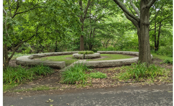
The Stone Circle of Herter Park