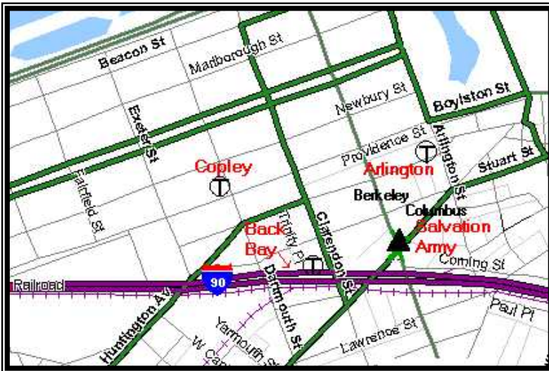
General Meeting – Boston Salvation Army Corner of Berkeley St. and Columbus Ave.