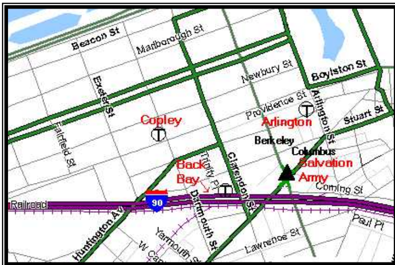
General Meeting – Boston Salvation Army Corner of Berkeley St. and Columbus Ave.