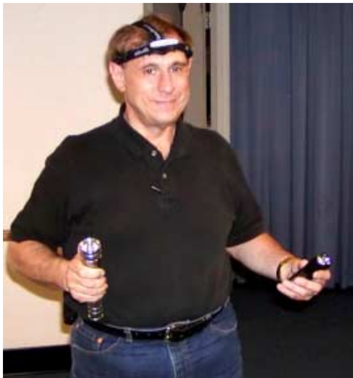
Our Prez sees the light

Views of the Show and Tell demonstration at the May 2004 BARC General Meeting.