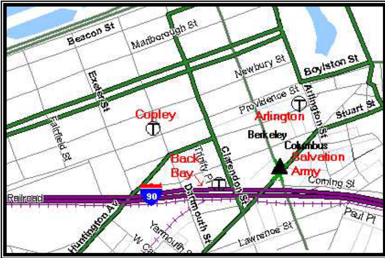
General Meeting – Boston Salvation Army Corner of Berkeley St. and Columbus Ave.