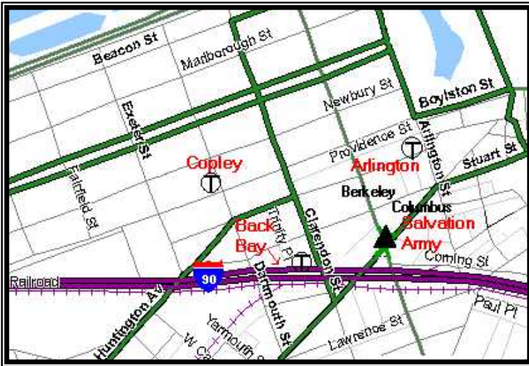
General Meeting – Boston Salvation Army Corner of Berkeley St. and Columbus Ave.