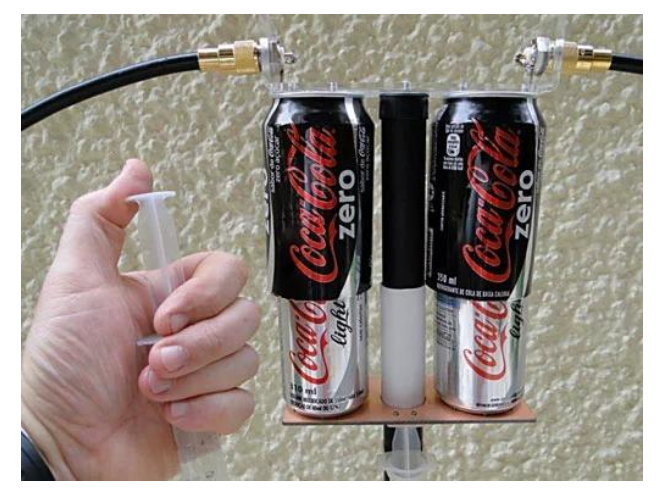
it's another type of stimulant for contesting.

With BARC ready to come into a windfall of Coca-Cola (see the President's Message above) I have been doing some research on amateur radio uses for the drink, apart from its obvious stimulant uses in contesting. Those who took the Extra exam when I did will remember one of the incorrect answers to "What is a Beverage antenna?" was "An antenna constructed from soft drink cans."